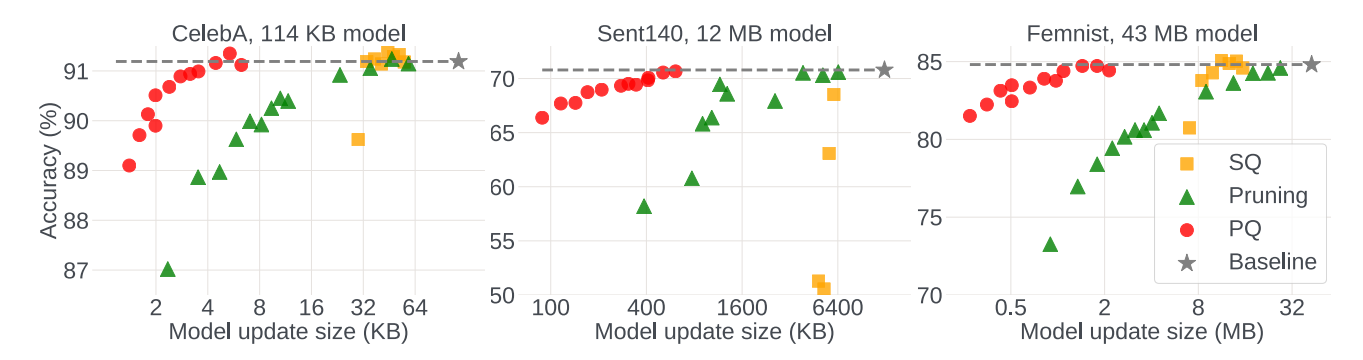
Figure 2: We adapt scalar quantization (SQ) and pruning to the SECAGG protocol to enable efficient and secure uplink communications. We also present results for product quantization (PQ) under the proposed novel SECIND protocol. The x axis is log-scale and represents the uplink message size. Baseline refers to SECAGG FL run without any uplink compression, shown as a horizontal line for easier comparison. Model size is indicated in plot titles. Uncompressed client updates are as large as the models when p = 32 (see Sec 3.1, shown as stars).

shares of the input). Encoding inputs as shares of one-hot vectors would lose the advantages of compression. Instead, each client can send evaluations of <u>distributed point functions</u> to encode each assignment [9]. These are represented compactly, but may require longer codewords to overcome the overheads.