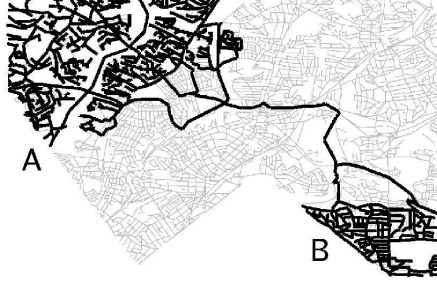
Figure 2: Example illustrating the path coherence in a road network of Silver Spring, MD. The 30,000 shortest paths (given in a darker shade) between every pair of vertices in A and B pass through a single vertex.

between spatially proximate source vertices and spatially proximate destination vertices will often pass through a common vertex, which is termed path coherence . Moreover, when the proximate source vertices are far from the proximate destination vertices we have the situation that the shortest paths between them have many common segments.